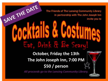
Our successful and spooky fundraiser!